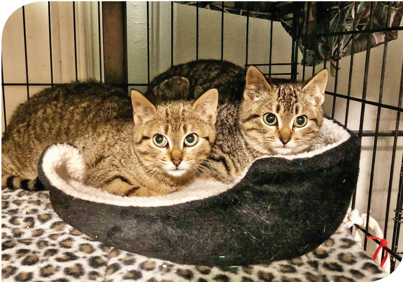
PARS volunteers help socialize rescues so they are adoption-ready.